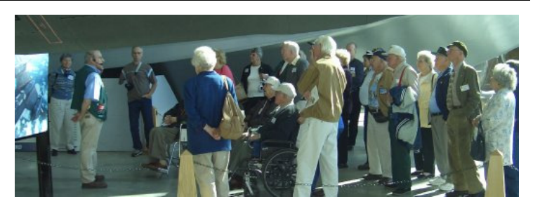
Under the Nose of the SR-71

Included perks in the Evergreen tour were visits to two