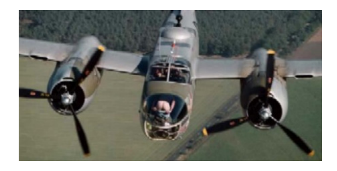
Is This Moon Over Miami Or Moon River?

<u>FOR THE NAVIGATORS</u> - The instructor of a WWII navigator training class was explaining about latitude, degrees and minutes. The instructor said, "Suppose I asked you to meet me for lunch at 23 degrees, 4 minutes north latitude and 45 degrees, 15 minutes eastlongitude?" After a confused silence, a voice volunteered, "I guess you'd be eating alone."