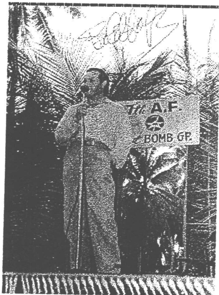
Bob hope during the Bob Hope Show, Makin 1944.